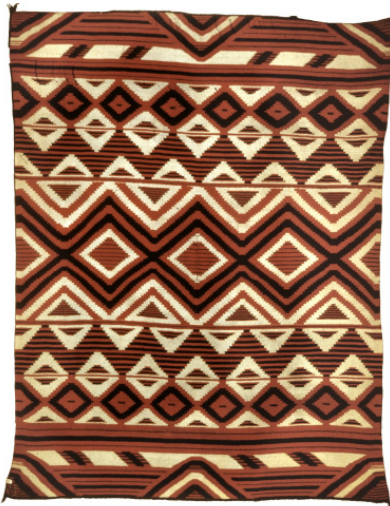
Classic Navajo sarape from the collections of Arizona State Museum (E-2774), circa 1840-1860, weaver unknown. One of 1,300 southwestern textiles included in the Joe Ben Wheat Southwest Textile Database, this splendid blanket is also featured in the Arizona State Museum Southwest Textile Database.