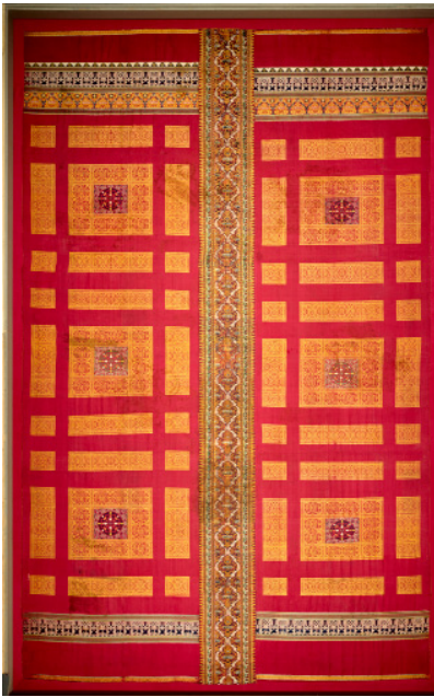
Alhambra Palace Silk Curtain, mid 1300s. Spain, Granada, Nasrid period. Silk; lampas weave; 438.15 x 271.78 cm. The Cleveland Museum of Art, Leonard C. Hanna Jr. Fund 1982.16.

is that it will be cut loose from the Koninklijk Instituut voor de Tropen (which contains all the archives and the library), and that the collections become property of the state. Regrettably, those curators and others who recently were cut from the staff as a money saving measure will not be coming back, an example of, "the wrong way to save money" to lose that much expertise... But all in all not a bad deal in a bad time. Hurray!"