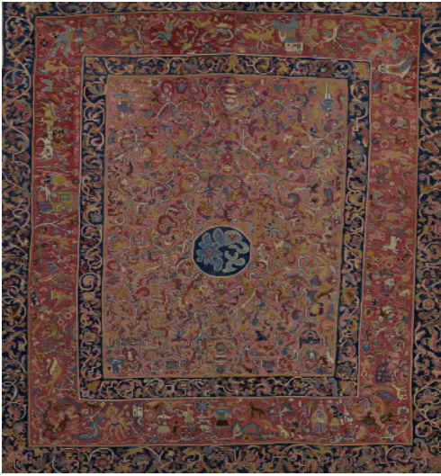
Peru, 17th Century, Tapestry weave, cotton and camelid fiber, 89 9/16 x 84 3/4 in. (227.5 x 215.3 cm). The Metropolitan Museum of Art, Purchase, Morris Loeb Bequest, 1956.

Elena Phipps is Guest Curator for fall exhibitions on both coasts. In New York, see “Interwoven Globe: Textiles and Trade 1500-1800” at the Metropolitan Museum of Art, Sept. 16, 2013-Jan. 4, 2014. The exhibition focuses on trade textiles that blended the traditional designs, skills, and tastes of all of the cultures that produced them.