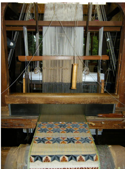
Stars and velvet on the loom at the Lisio Foundation.

The Lisio Foundation School in Florence, Italy has received official recognition from the Italian state as a certified educational institution. This certification of quality will allow those who seek economic support for their studies easier access to funding. The Foundation offers many learning opportunities each semester on designing and weaving Jacquard textiles, as for: woven textile identification and analysis, recognition and cataloguing of lace, recognition and cataloguing of embroidery. Special courses are offered in Kente cloth weaving, use of the vertical loom, and woven shibori. For information please contact: didat@fondazione-lisio.org