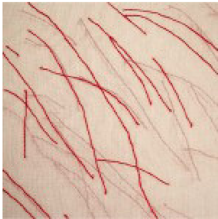
Detail, "Red Wind" by Akiko Kotani, 2013.