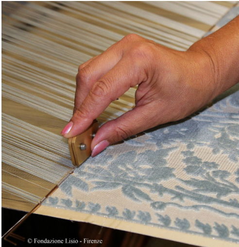
Cutting velvet pile at the Lisio Foundation's weaving school.