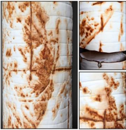
Detail, "Future Ruins" by Regina Benson, 2013.