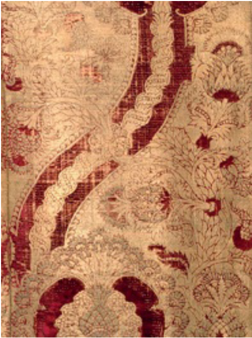
Detail of painted altar frontal.