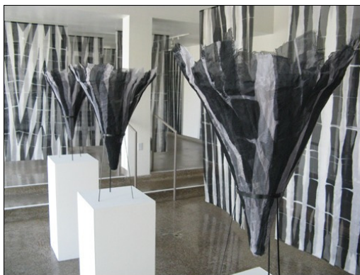
Detail, "Vox Stellarum" installation by Elin Noble, 2013, The Textile Center.