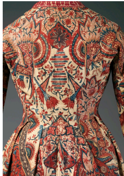
Left, Netherlands, mid-18th century, Textile: India (Coromandel Coast), 1725-50. Cotton, drawn and painted resist and mordant, dyed. Length: 52 1/8 in. (133 cm) The Metropolitan Museum of Art, Purchase, Isabel Shults Fund, 2012