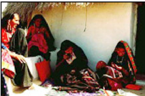
Kala Raksha embroiderers.