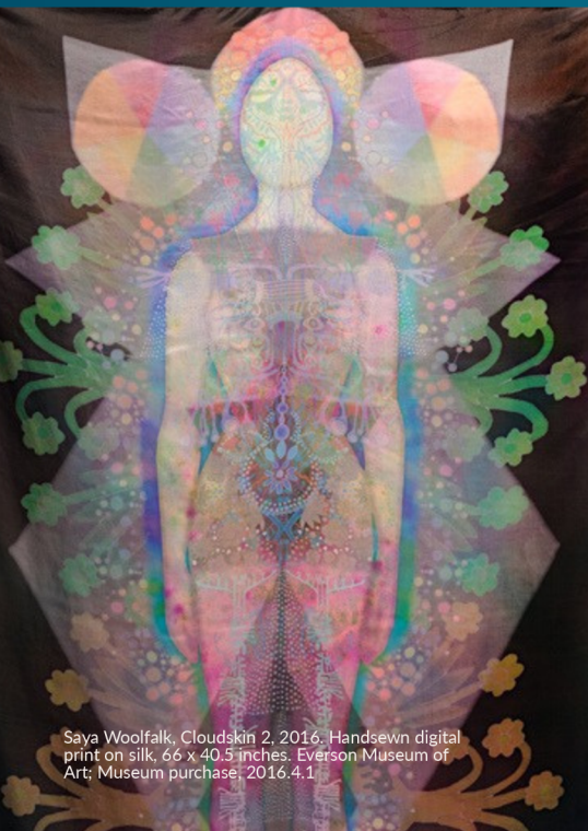
Saya Woolfolk, Cloudskin 2, 2016. Handsewn digital print on silk, 66 x 40.5 inches. Everson Museum of Art; Museum purchase, 2016.4.1.

Supporting the study of global textile traditions & study of textiles